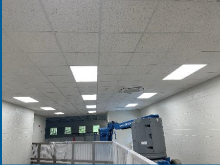
Ceiling Grid Install in Area A