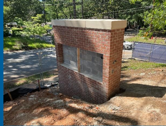
Monument Sign Cast Stone and Brick Installed