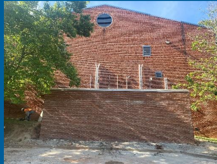
HVAC Units Masonry Screen wall Installed