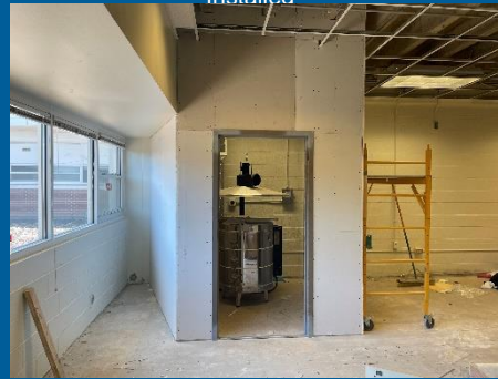
Kiln Room Closet Installed