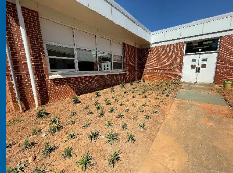
Onsite Planting Ongoing