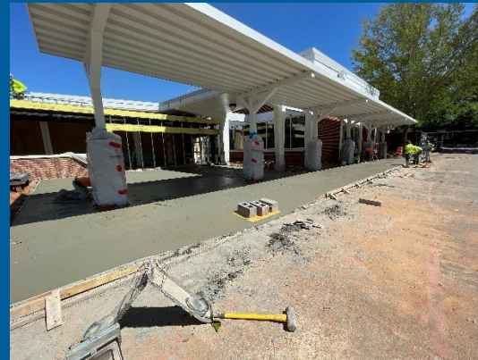
Vestibule and Canopy sidewalk concrete poured